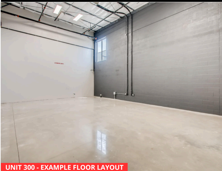
UNIT 300 - EXAMPLE FLOOR LAYOUT